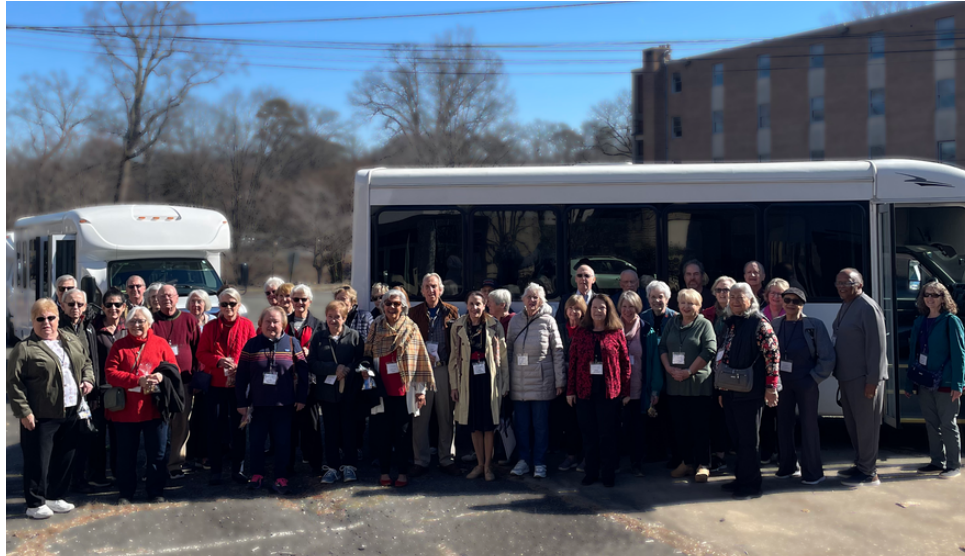
Travel Adventure - "Love Takes Flight"

We are dedicated to delivering impactful programs that uplift and benefit the community through integrity and a servant heart.