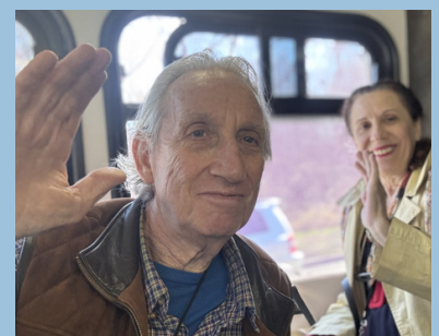
Travel Adventures Participants

We are dedicated to eliminating obstacles for Mecklenburg residents, ensuring they can fully engage with our programs. With this goal in mind, we are pleased to introduce our Scholarship Program . This program will cover registration fees and/or transportation expenses for individuals interested in joining our Lifelong Learning Programs (Adventures in Learning, Travel Adventures, Tech Tuesdays), removing barriers to participation for those who may encounter financial limitations. Individuals interested in applying or seeking more information are encouraged to contact the Shepherd's Center of Charlotte office at 704-365-1995.