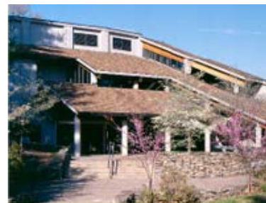
Southern Highland Folk Art Center